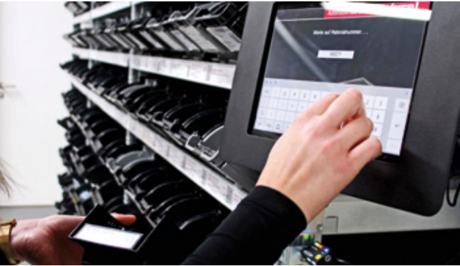
The KEB controller developed in-house, runs on a Windows tablet attached to the shelf