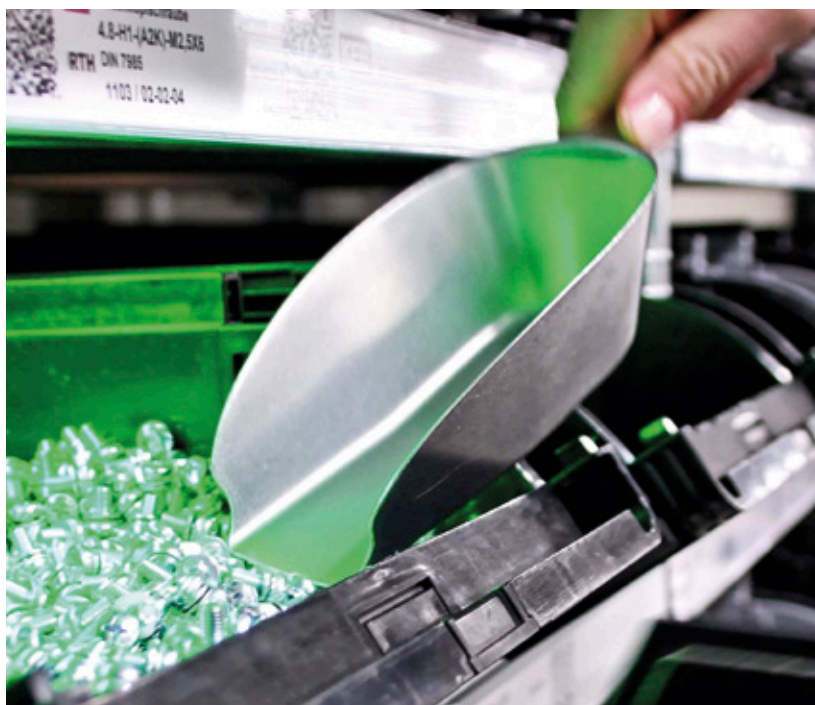
The required C-parts are illuminated and can be taken immediately, the WLS15 strip lights are mounted behind the fold of the shelf plate

Placing the empty KLT box on the top shelf initiates the transfer of the article and container data to the supplier's central warehouse, which triggers the